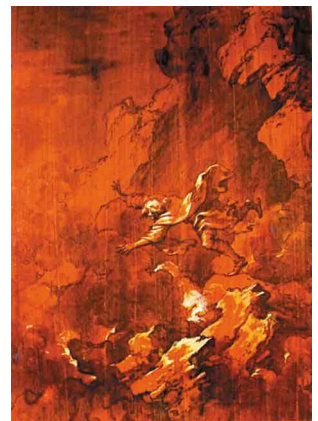
Salvator Rosa, The Death of Empedocles, c. 1665-1670