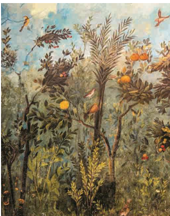
Chorus at dawn in Livia's landscape Villa Livia, Prima Porta, Rome, 30-20

Elemental Chorology – Vignettes Imaginales , by Nicoletta Isar, 2020, Bound, 24x17cm. 448 pp. (304 pp. text plus more than 250 illustrations mostly in full colour), ISBN 9789080647602. PRICE: 250 Euros